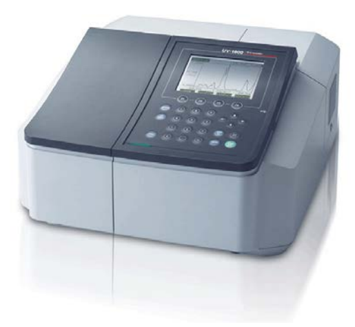
Shimadzu UV-1800 Spectrophotometer

enables users to save measurement data to USB memory for data analysis and printing on a PC.